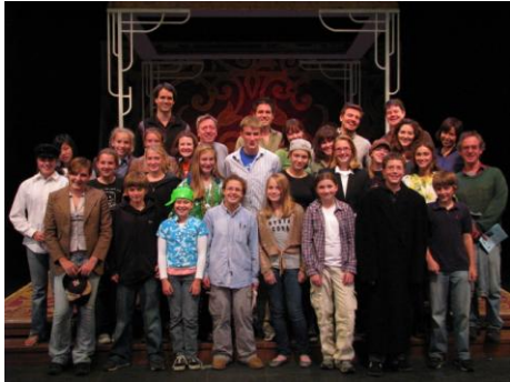
Maple Street School students and faculty with the cast of AS YOU LIKE IT , 2008

Page to Stage schools are invited to a special evening performance (Sept 27, 2010 at the Paramount Theatre in Rutland) in which selected scenes from each school are rehearsed and presented that evening on the set of the WPTC production, followed by a discussion with the Playhouse director and cast. Parents and faculty are invited to attend the scene presentations, and a color photograph is taken of the school groups with the WPTC cast on the set.