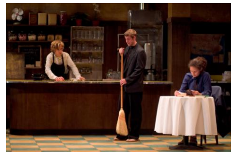
Green Mountain Union High School students perform scenes from " MASTER HAROLD "...and the boys on the Weston stage, 2007

Schools receive two classroom visits in the early fall by WPTC artist/teachers who work with students to stage short scenes from the school matinee-selected play. Participating students and teachers are provided copies of the script, and teachers attend a special spring workshop, in which they will receive a study guide and assistance with the program. Faculty members are responsible for rehearsing the students between WPTC visits, building on the principles established in the in-school sessions and spring teacher workshop. Schools are encouraged to share these scenes in classroom